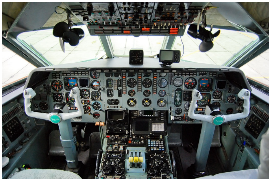
A Yak-42D cockpit

An export order for seven aircraft was announced in 1982 by Aviogenex of Yugoslavia, but the contract lapsed. The availability of the longer-range Yak-42D variant from 1991 onwards gave rise to a few more export sales, to Cuba and China. As of 1 January 1995 a total of 185 Yak-42 had been produced, including 105 Yak-42Ds.