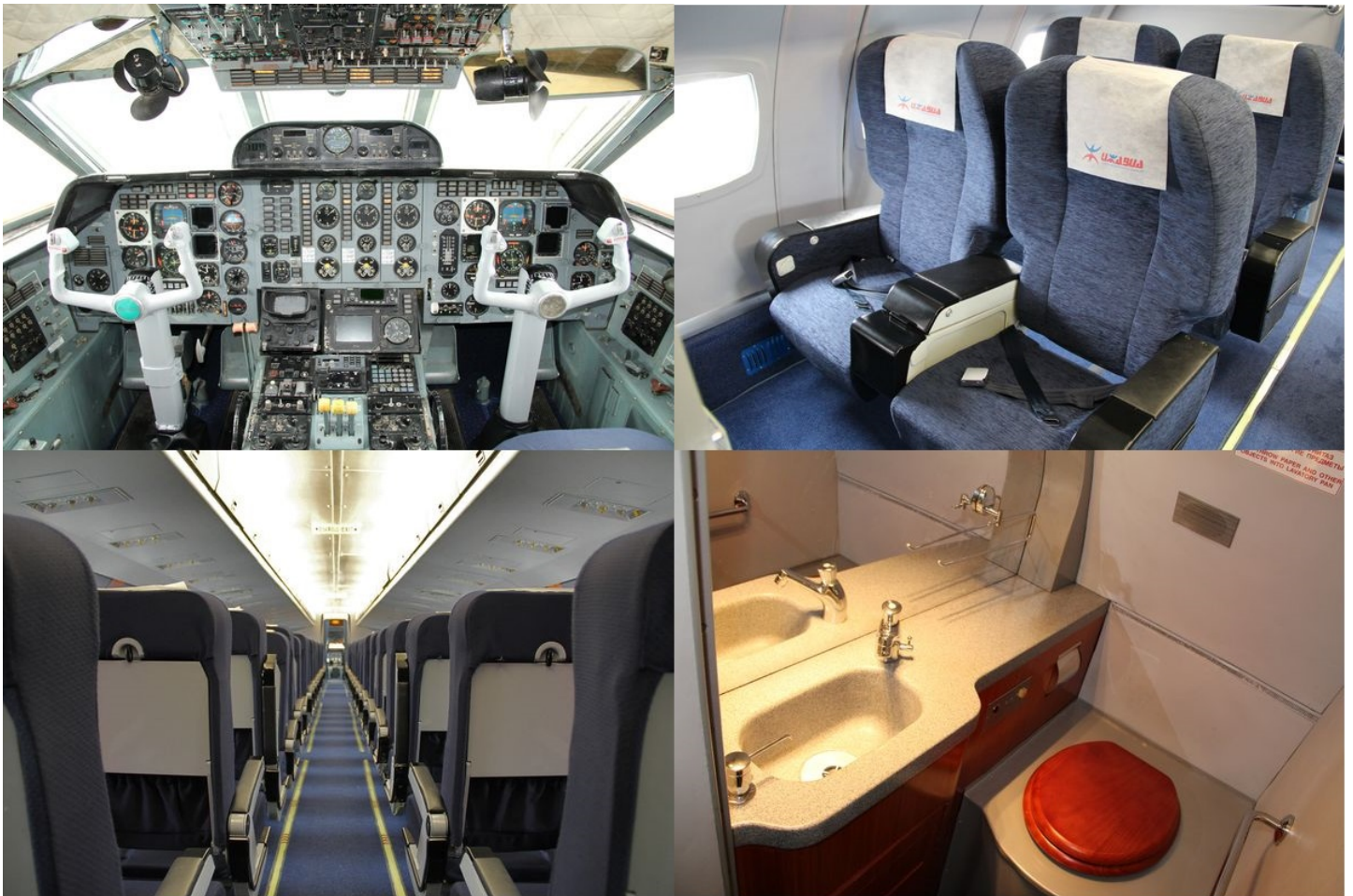
Option Yak-42D 8 first class and 96 economy class (Izhavia)

maintaining good economy, as many Soviet airports had been upgraded to accommodate more advanced aircraft, it did not have to have the same ability to operate from grass strips as Yakovlev's smaller Yak-40. The requirement resulted in the largest, heaviest and most powerful aircraft designed by Yakovlev, until the even larger MC-21 took flight in 2017.