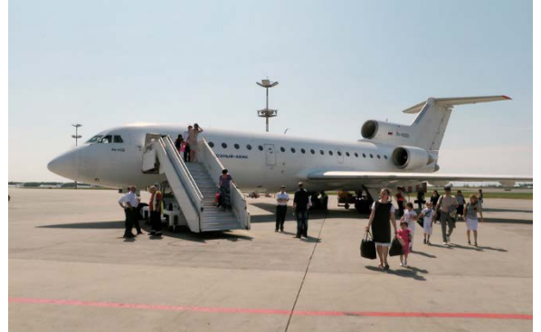
Grozny Avia Yak-42 disembarking passengers