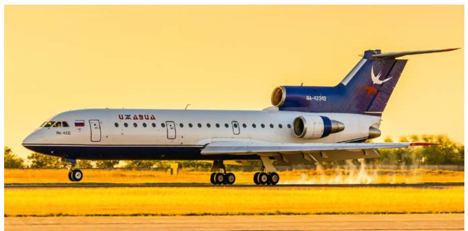
Side view of a Yak-42 (Izhavia)

Initial design proposals included a straight-wing airliner powered by two Soloviev D-30 turbofans and resembling an enlarged Yak-40, but this was rejected as it was considered uncompetitive compared to Western airliners powered by high bypass ratio turbofans. Yakovlev settled on a design powered by three of the new Lotarev D-36 three-shaft high-bypass turbofans, which were to provide 63.90 kN (14,330 lbf) of thrust. Unlike the Yak-40, the new airliner would have swept wings.