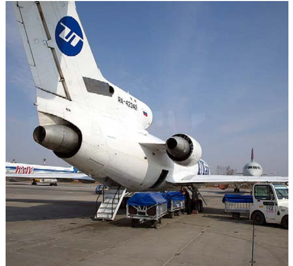
Yak-42 seen from behind with rear airstair deployed

Two engines were mounted in pods on either side of the rear fuselage, with the third embedded inside the rear fuselage, fed with air via an "S-duct" air inlet. An auxiliary power unit (APU) is also fitted in the rear fuselage. No thrust reversers are fitted. The aircraft has a T-tail, with both the vertical fin and the horizontal surfaces swept.